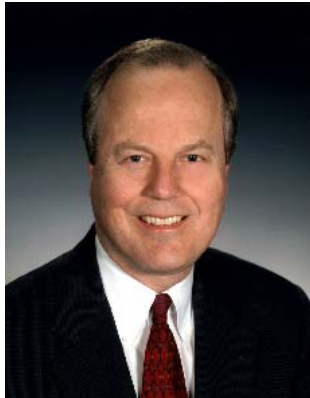
Rep. Ed Whitfield (R-KY)