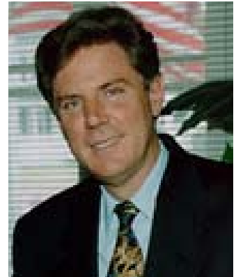
Rep. Frank Pallone (D-NJ)

The National All Schedules Prescription Electronic Reporting Act (NASPER) of 2003 was introduced in the Energy and Commerce Committee of the House of Representatives on September 4, 2003, by Representative Ed Whitfield (R-KY) , and Representative Frank Pallone (D-NJ) .