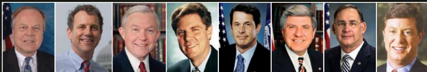
REPRESENTATIVE ED WHITFIELD (R-KY)